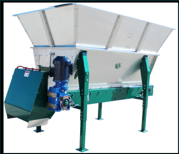
4 Cubic Yard Hopper