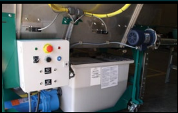
Recirculation Tank with multiple drain screens