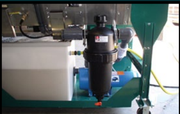
In-line filtration system to decontaminate water prior to product watering