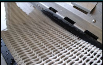
Optional "dip" for submerged and semi-submerged watering