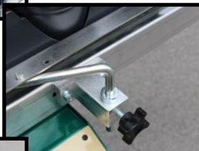
Guide rail adjustment