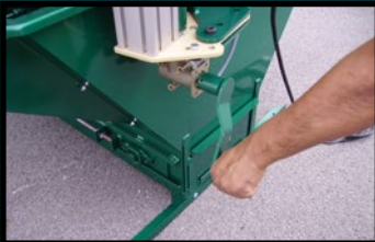
Single Crank Adjustment