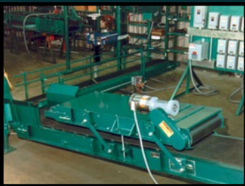
Flattening conveyor prepares bags for stacking