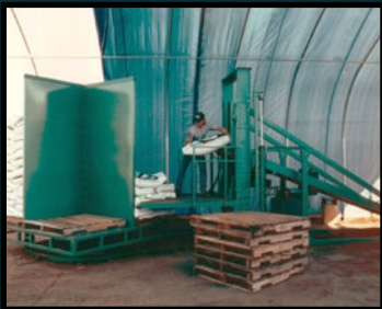
Non-stop operation with revolving palletizing carousel