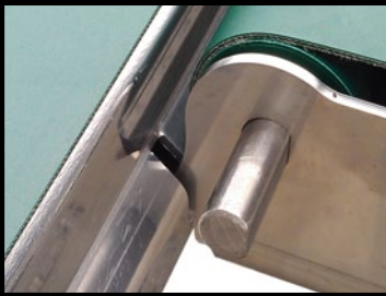
Patented side mounting system